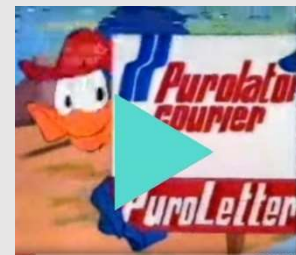
Click here for a Purolator animated ad from 1986

This year marks our historic 60 th anniversary. We are looking for memories, photos and stories to share with our Purolator family on the Workplace Purolator 60th Anniversary page. Click here to find out more and how to participate to win prizes.